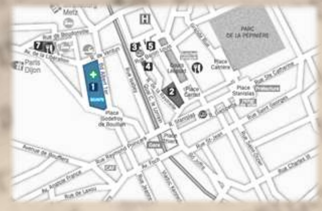
Map of the campus (Bldg. A, Room 104)

Locating the university in Nancy (in blue)